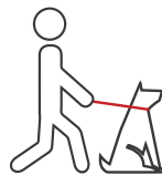
NASDU L3 SIA Licenced Dog Handlers